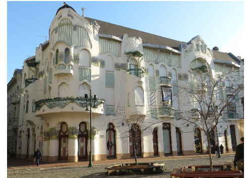
1. Conference opening and Keynote 1 in the REÖK Gallery, the fabulous Art Nouveau house