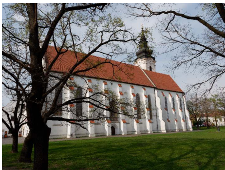
3. The Franciscan Church, Monastery, and Museum, much worth the visit