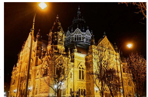
4. The world famous Art Nouveau Synagogue