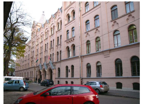
2. Faculty of Arts Building, venue of all the sessions (at its corner: Café "Agár Úr," venue of the opening reception)